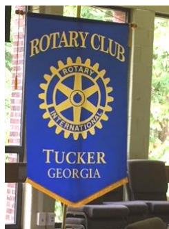
The New Banner for the Rotary Club of Tucker